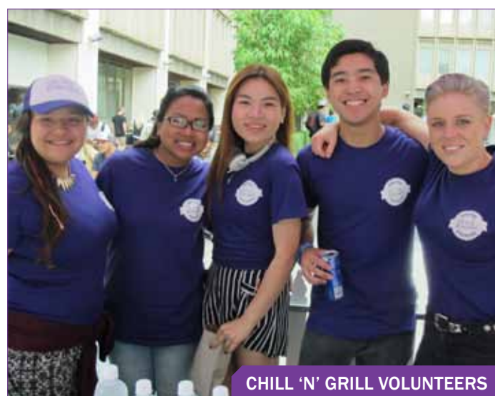
CHILL 'N' GRILL VOLUNTEERS

This Quarter the activities & events department have increased branding and awareness at Chill & Grill, by not only using biodegradable cups and napkins but also getting the bio cup and napkins we used branded in our colours and logo. RUSU collaborated with the RMIT music industry students to help them showcase their work. RUSU clubs have also started to book tables at Chill 'n' Grill so they can regularly promote their own activities.