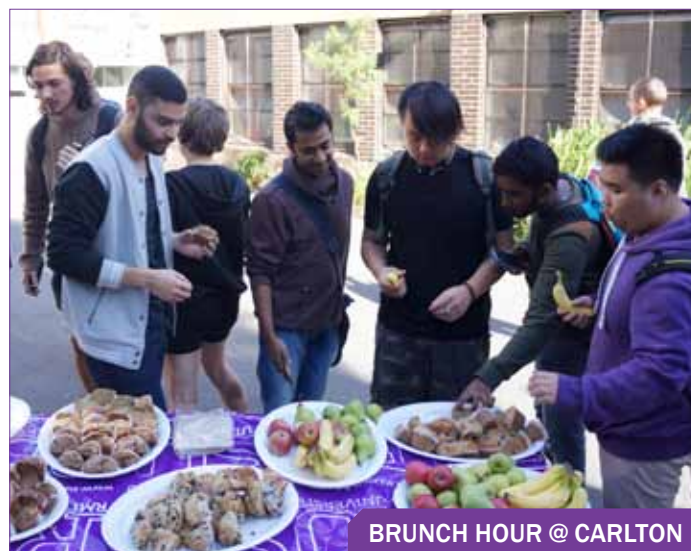
BRUNCH HOUR @ CARLTON