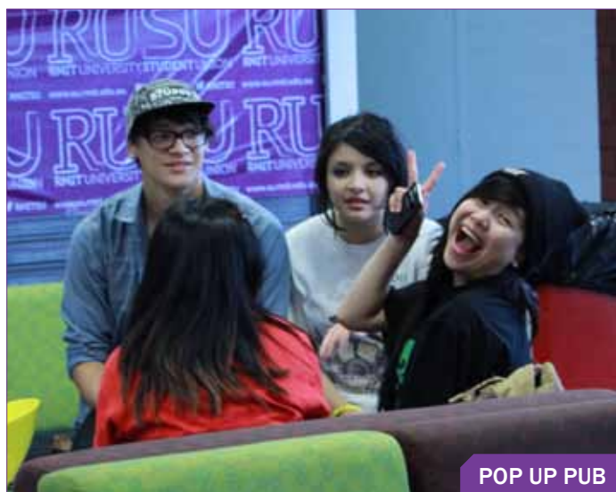
POP UP PUB

TAFE students enjoy a free brunch during their 11 o'clock break on Tuesday each week. In the building 57 courtyard, RUSU staff and volunteers distribute fresh fruit, currant scones and zucchini and orange muffins to over 150 students.